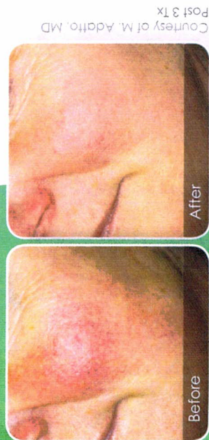
Post 3 Tx